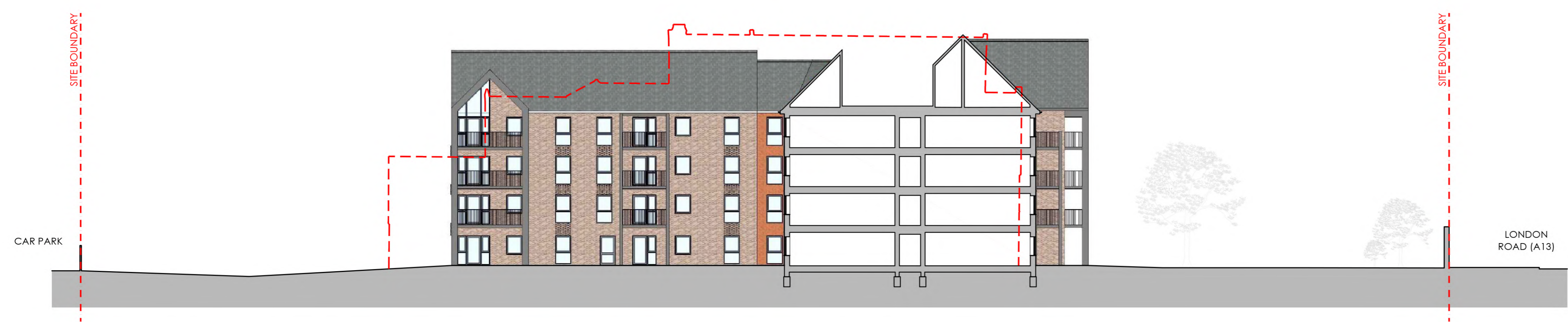
SECTION B-B - TYPICAL SECTION THROUGH BLOCK B SCALE 1:200