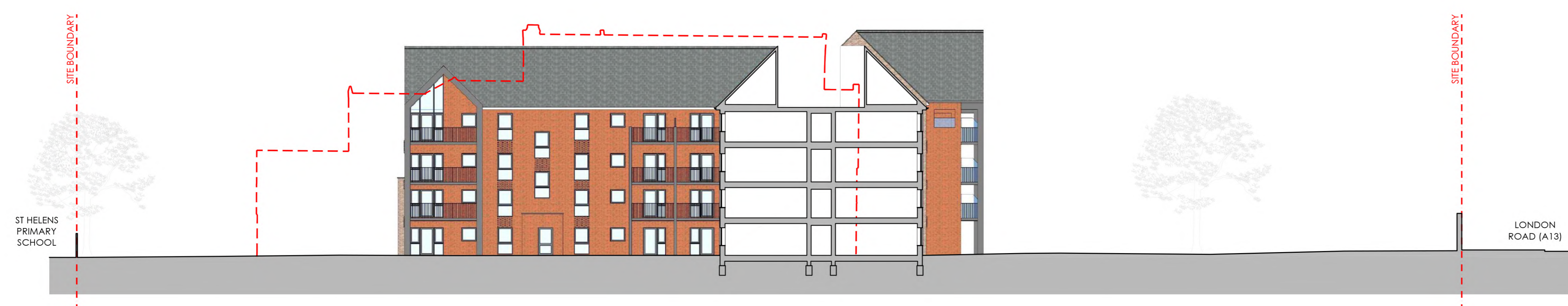
SECTION A-A - TYPICAL SECTION THROUGH BLOCK A SCALE 1:200