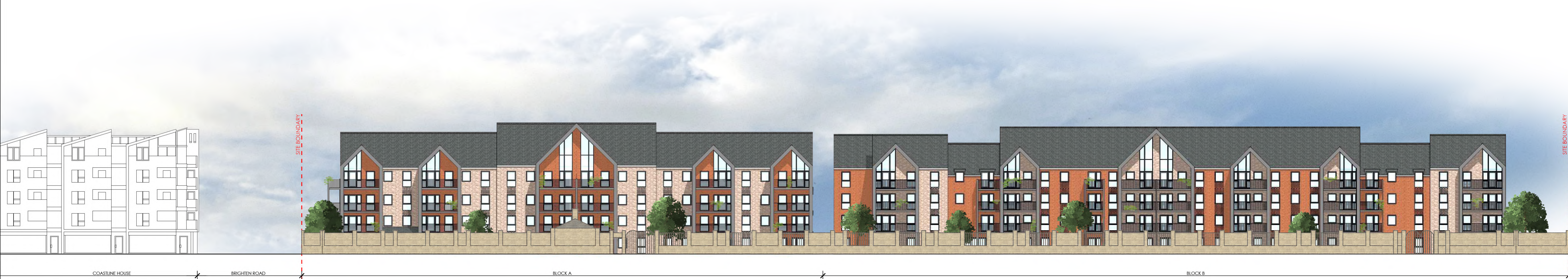
STREET ELEVATION - LONDON ROAD (A13) SCALE 1:250